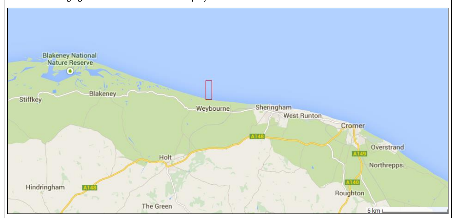
Overview of Project Area

The following figure shows an overview of the project area.